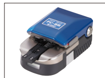
Handy cleaver FC-8R series