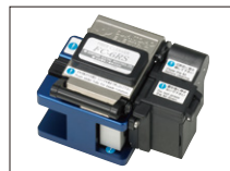
Table-top cleaver FC-6 / FC-6R series