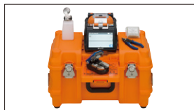
Carrying case with worktable CC-82

Items listed in Basic Accessories are always included with the splicer body. Overall kit content may vary regionally. Please check with your local authorised reseller to confirm kit content in your region.