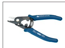
Jacket remover JR-M03